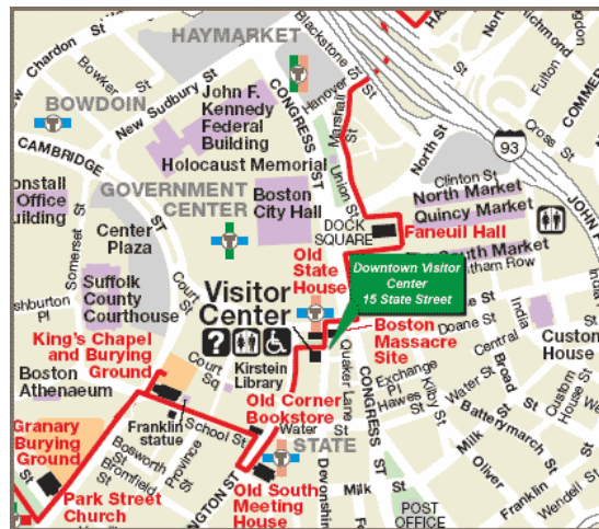
Location of Downtown Visitor Center, 15 State Street

A free public Freedom Trail tour that accommodates 30 people leaves from here at 2:00 PM, first come, first served. Rangers will distribute free stickers 30 minutes before tour time.